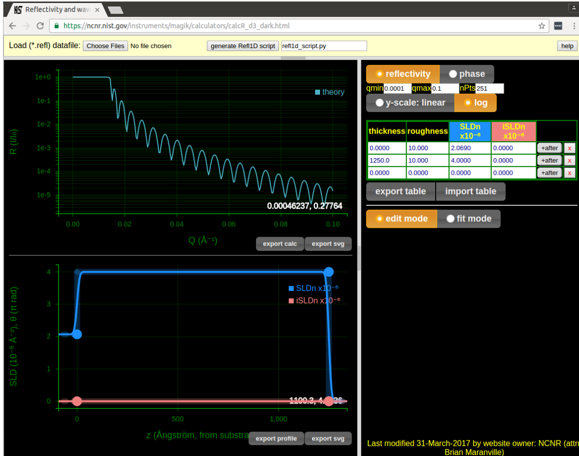
Fig. 1. Screenshot of non-magnetic reflectivity calculator.

The roughness, defined as the width of a smooth transition (an error-function) between layers of constant SLD is handled in this application using the Nevot-Croce approximation [4] in which the reflectance of a given interface is reduced by an exponential factor depending on the roughness. This approximation has been shown to be accurate for roughnesses that do not approach the thicknesses of the layers on either side.