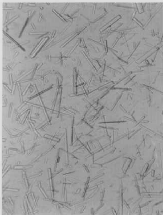
FIGURE 1. 1.1\text{BaO}\cdot\text{Al}_2\text{O}_3\cdot 6\text{H}_2\text{O}

precipitation was first observed after several days. Constant agitation appeared to have little if any effect at first, but probably accelerated precipitation after it had once started. The compound exists in the form of needle-shaped crystals (fig. 1)