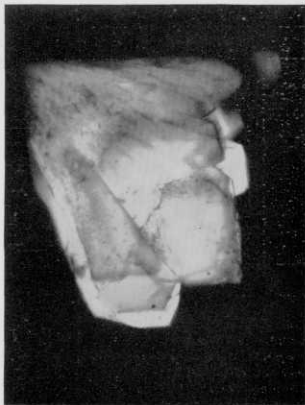
FIGURE 5. \text{BaO}\cdot\text{Al}_2\text{O}_3\cdot 2\text{H}_2\text{O} .

The dihydrate occurs as flat plates, usually grown together in foliated aggregates. A fragment of one of these aggregates is shown in figure 5, photographed under crossed nicols. The crystals are biaxial positive, with very low birefringence, and parallel extinction. The indices of refraction are: \alpha=1.610 ; \gamma=1.613 .