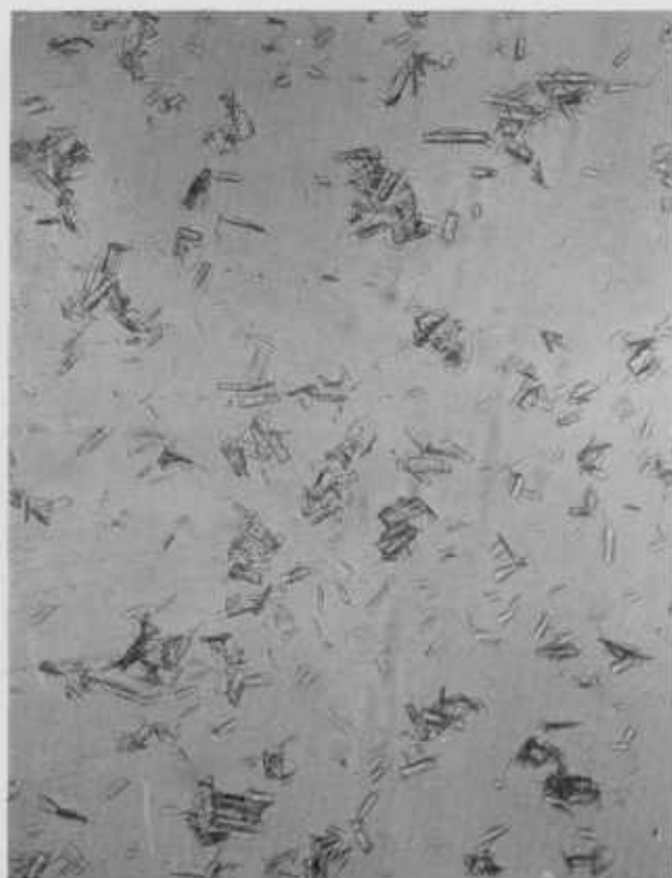
FIGURE 2. \text{BaO}\cdot\text{Al}_2\text{O}_3\cdot 7\text{H}_2\text{O} .

crystallization is so loosely bound that it is removed by such treatment. Thermal analysis indicates that most of the water is driven off below 120° C. Microscopic examination revealed the presence of a small amount of impurity believed to be hydrated alumina. This would explain the slight excess of \text{Al}_2\text{O}_3 over BaO. The compound appears in the form of exceedingly thin flakes, approximately rectangular in outline (fig. 2). The crystals obtained were too small to permit a determination of optical character and sign. The indices of refraction are \alpha=1.538 , \gamma=1.556 . The elongation is positive. X-ray data are given in table 1.