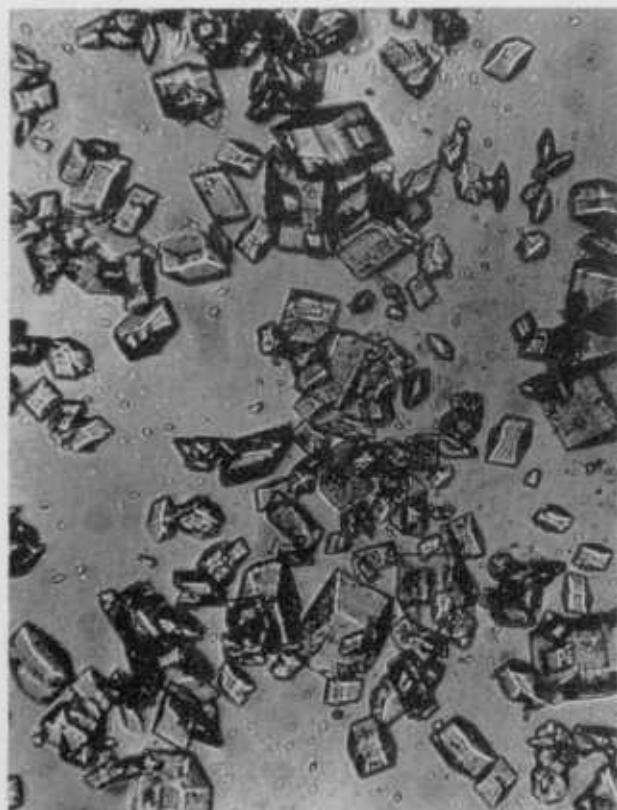
FIGURE 4. \text{BaO}\cdot\text{Al}_2\text{O}_3\cdot 4\text{H}_2\text{O} , rhombohedral form. Magnification, \times 250 .

of concentration not yet defined. It appears certain, also, that the heptahydrate is less stable at higher temperatures. This is supported by the following experiment. A sample of \text{BaO}\cdot\text{Al}_2\text{O}_3\cdot 7\text{H}_2\text{O} in contact with barium aluminate solution was withdrawn from a reaction mixture that had stood for 4 months at room temperature without apparent change. The sample was held at 60^\circ\text{C} for 7 days, at the end of which time it was found to have been changed completely to \text{BaO}\cdot\text{Al}_2\text{O}_3\cdot 4\text{H}_2\text{O} .