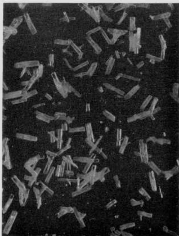
FIGURE 3. \text{BaO}\cdot\text{Al}_2\text{O}_3\cdot 4\text{H}_2\text{O} , prismatic form.

between the solution and the precipitate of \text{BaO}\cdot\text{Al}_2\text{O}_3\cdot 7\text{H}_2\text{O} . The new phase occurred as prismatic crystals, averaging 2 mm in length (fig 3). Because of their size, they were readily separated from the hexahydrate for examination and anal-