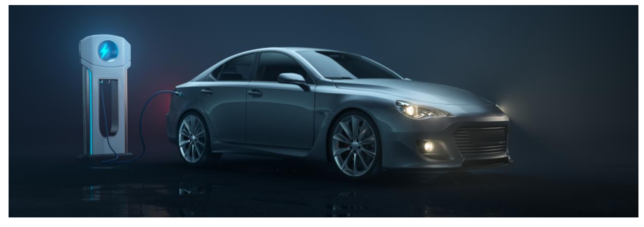
Fig. 1. Charging an EV.