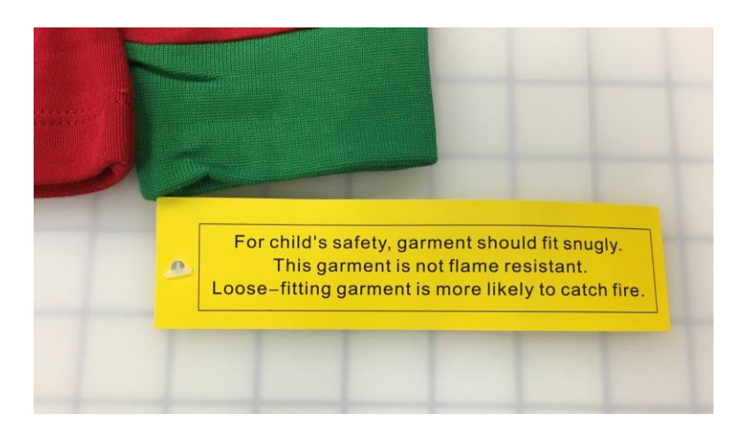
Figure 2: Tight-fitting sleepwear must bear a specific hangtag bearing no other information or have a label on the packaging