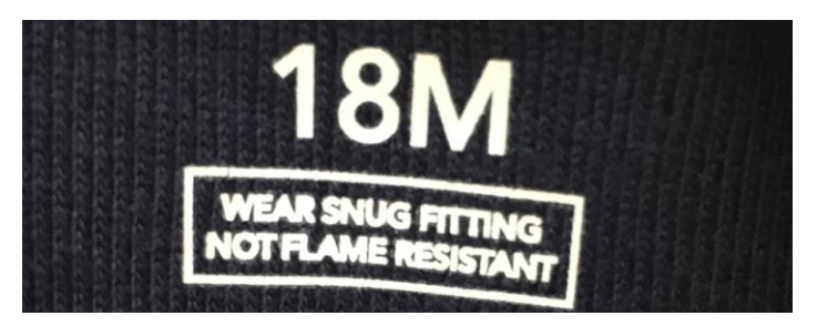
Figure 1 - Tight-fitting sleepwear must also bear a label immediately below the size designation on the front of the sizing label located on the center back of the garment

Tight fitting sleepwear must comply with all of the flammability requirements for clothing textiles (16 CFR 1610) or vinyl plastic film (if applicable).