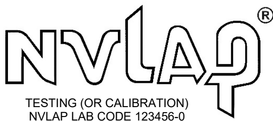
Figure 1. NVLAP symbol.