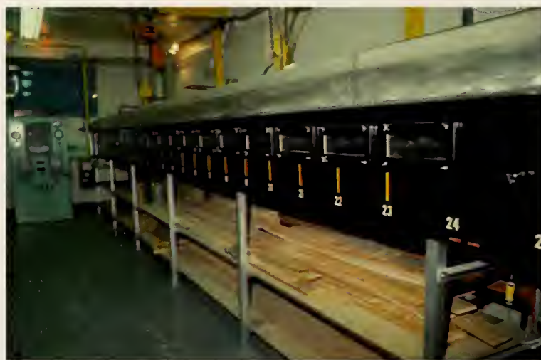
Figure 3 Photograph of Tunnel Test Apparatus, ASTM E84, NFPA 255, & UL 723

Surface flammability of interior finishes, including flooring, apparently was addressed in 1926, as reported by the NFPA Quarterly. 33 The danger from interior finishes was emphasized again during the 1940s by fires such as the Coconut Grove night club fire (1942), the Winecoff, La Salle, and Canfield Hotels fires of 1946, and the St. Anthony Hospital fire of 1949. 34 Each of these fires had heavy loss of life and extensive property damage resulting in large financial losses. As a result of these fires S. H. Ingberg (NBS) and A. J. Steiner (of Underwriter's Laboratories) took on the challenge to develop a fire test method for measuring the fire performance of finishes and flooring materials. This work saw the development of a large flame-spread tunnel furnace which eventually became an Underwriters' Laboratory test method in 1944 and also became ASTM E84 (in 1950), and was adopted by NFPA as Standard No. 255. 34 (Figure 3)