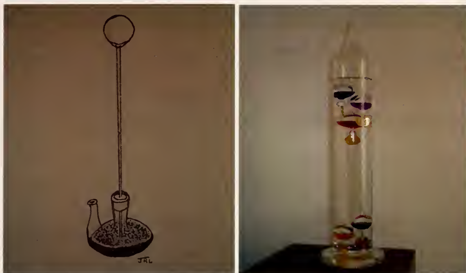
Figure 1 Galileo thermoscope sketch (left) photograph of modern thermoscope (right).

Note: Sketches and photographs presented in this document were drawn or taken by NBS/NIST personnel.