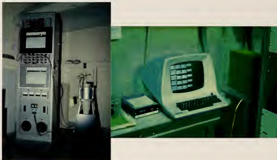
Figure 5 Photographs of strip chart recorders (left) and computer terminal (right).

Note in the figure above, the two strip chart recorders are taking temperature data from the combustibility furnace located to the right. Also, the computer terminal shows data sets being recorded from an oxygen consumption calorimeter fire test.