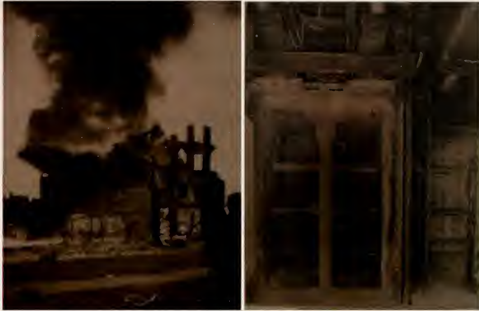
Figure 2 NBS Federal Triangle fire test (left) & NBS column furnace (right), 1920s.