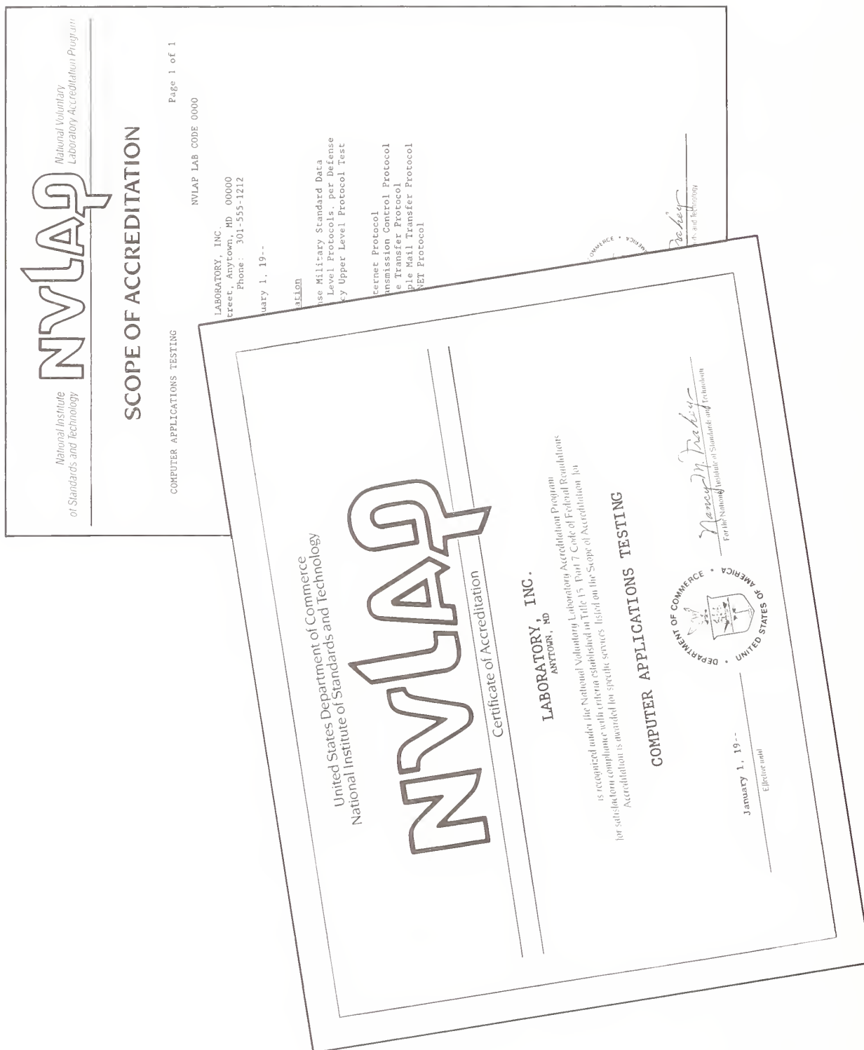
Figure 1. NVLAP Certificate and Scope of Accreditation (sample).