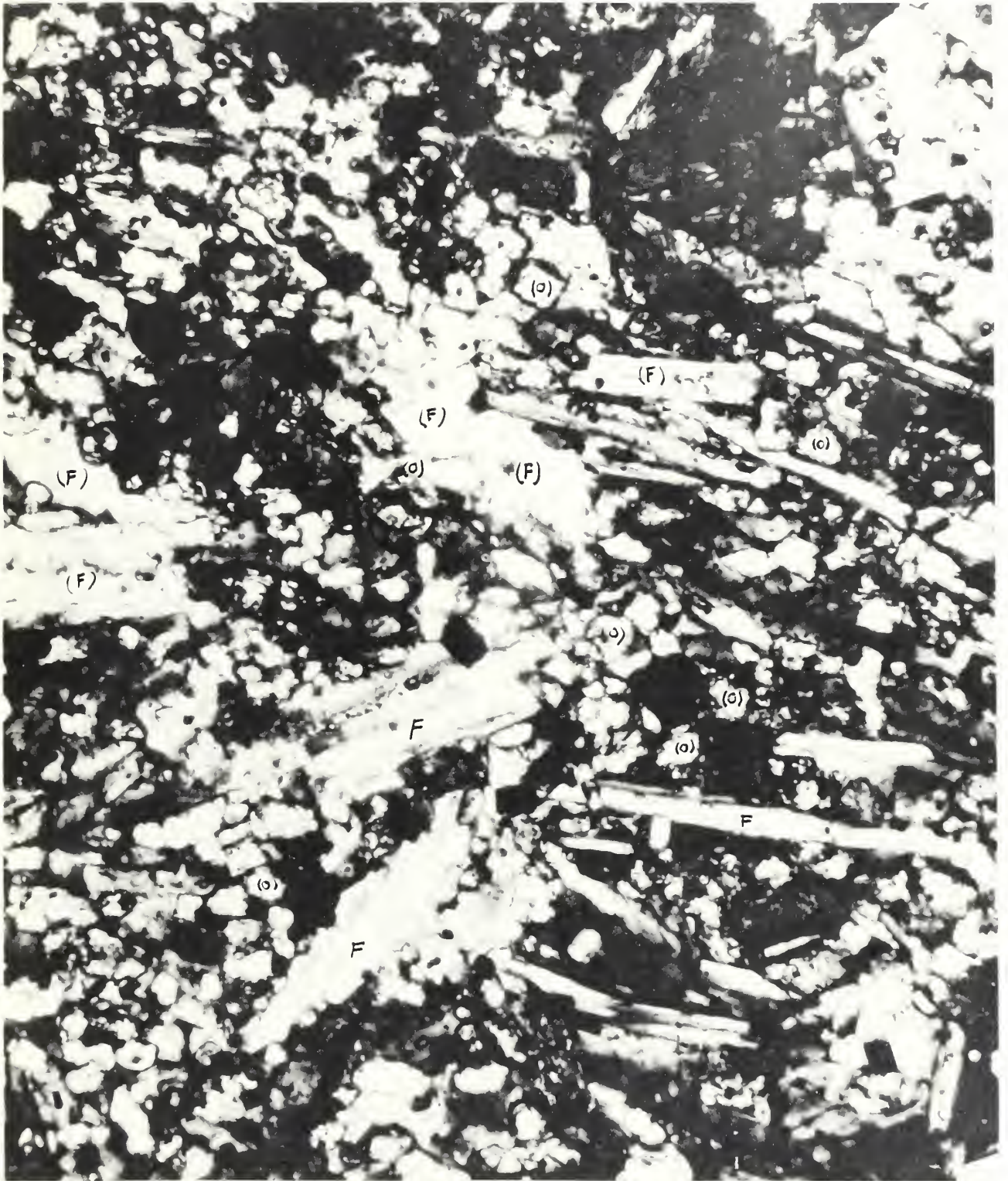
Figure 1. Photomicrograph of Napa Basalt (300x) (Crossed Nicols). Showing zoned Plagioclase in Matrix of Feldspar (F), Olivine or Pyroxene (O) and Magnetite Crystals.