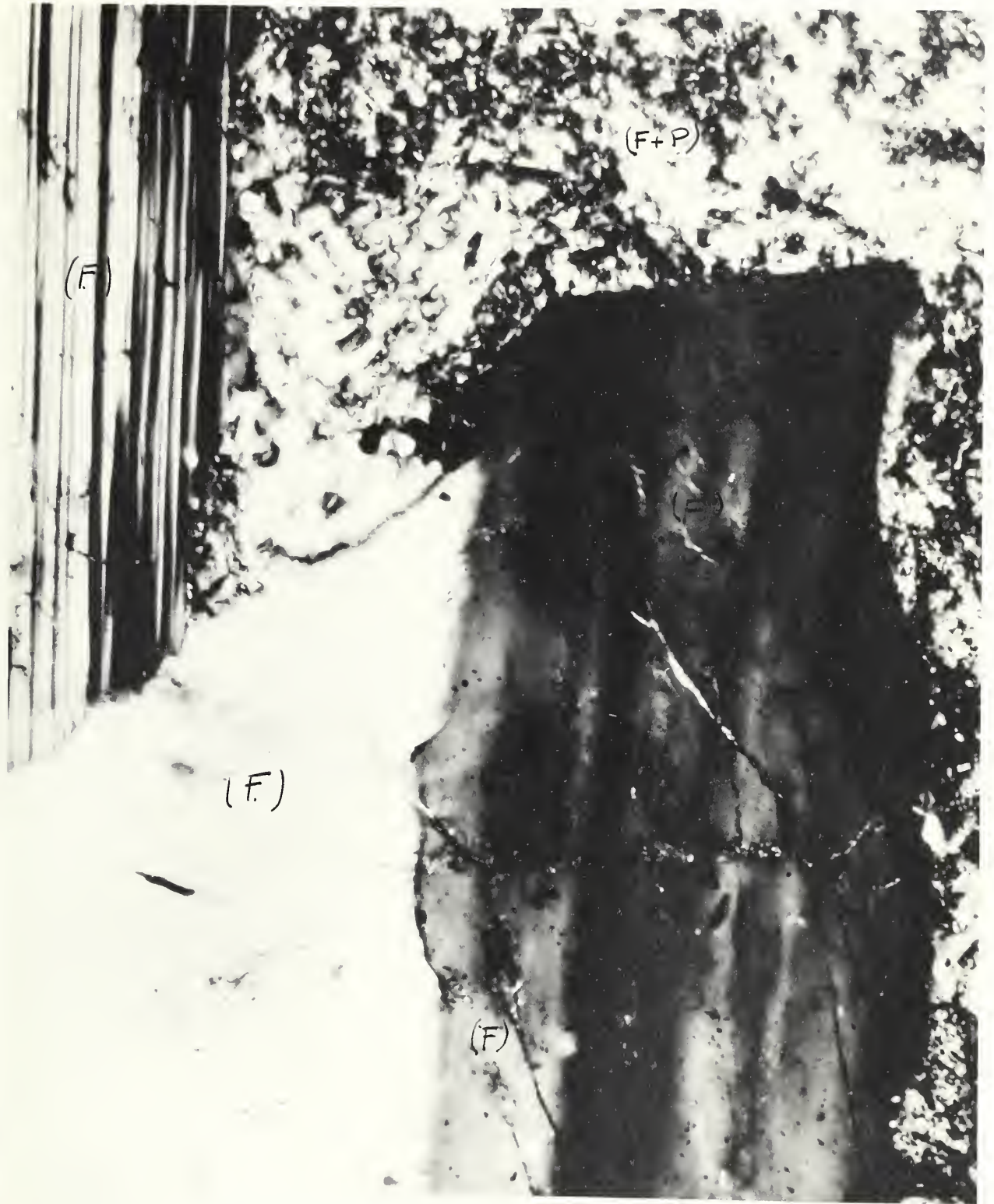
Figure 3. Photomicrograph of Napa Quarry (300x) (Crossed Nicols). Showing zoned Plagioclase Feldspar crystals (F) in a matrix of fine feldspars and pyroxene (F & P). Secondary quartz may be present. Rock in hand specimen appears porous and altered.