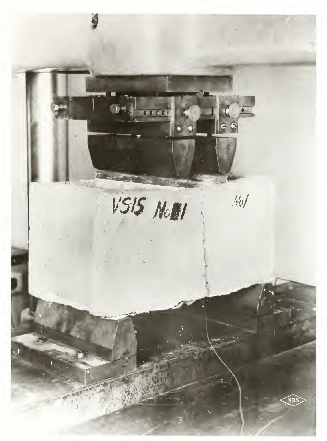
Figure 3 - Flexure load specimen, after test.