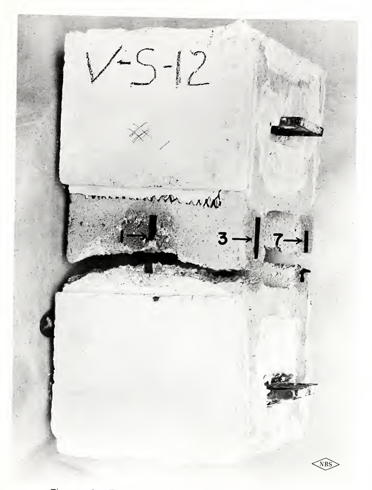
Figure 2- Tensile load specimen, after test.