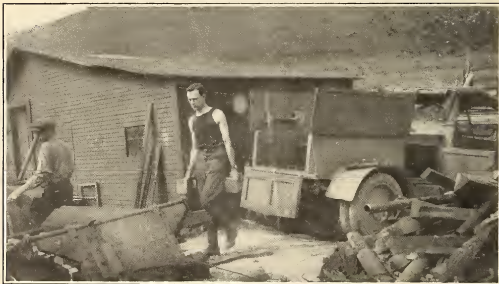
FIG. 5.— Another method of moving test weights to drift-mine tibble inaccessible to truck by loading into mine car at accessible point on track