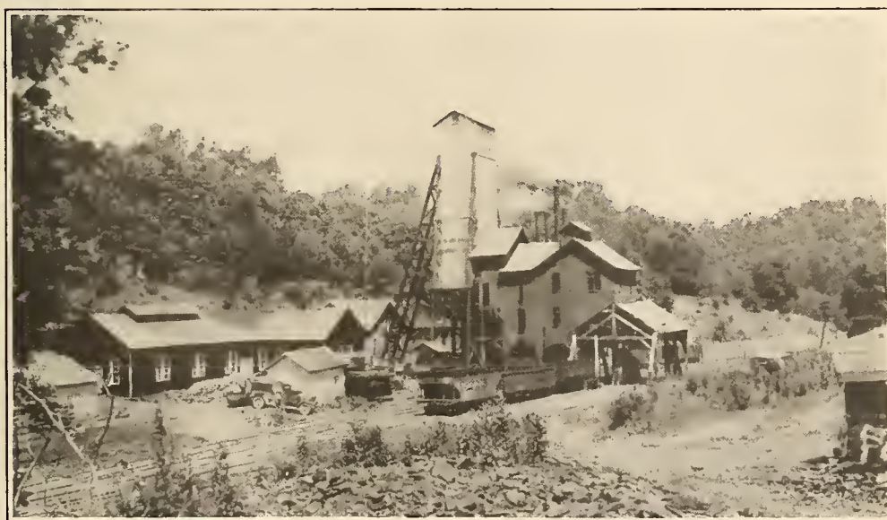
FIG. 3.— Typical shaft-mine tipple in southeastern Ohio fields; mine scale testing equipment being unloaded at left