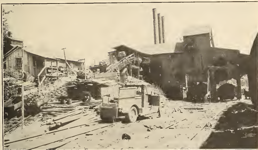
FIG. 2.— Drift-mine tipple, showing loaded cars of coal being hauled to scale; mine scale testing equipment in foreground