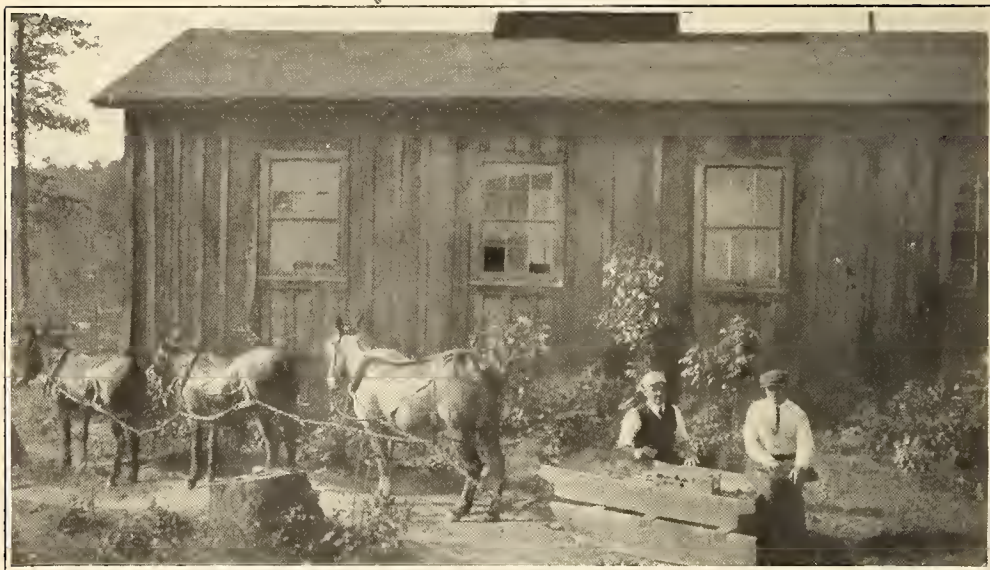
FIG. 4.— Transportation of test weights by mules and sled several hundred feet up mountain to mine inaccessible to truck