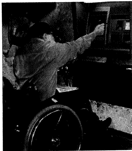
Figure 2: A need for a URC.

This problem is being addressed by INCITS/V2 [2]. INCITS/V2 is a technical committee working on standards for the InterNational Committee for Information Technology Standards (INCITS) in the area of Information Technology Access Interfaces. V2 is developing standards for an Alternative Interface Access Protocol (AIAP). The AIAP is a specification for providing a target's abstract user interface description. It specifies a flexible way of automatically generating a target's user interface on a specific personal device. Use of the AIAP allows personal devices such as hand-held devices, PDAs, small laptop computers, and cell phones to be used as a URC to control a variety of AIAP-compliant target devices. The AIAP-URC specifications are intended to include specialized assistive technology devices used by people with disabilities so that the awkward use of an ATM machine as shown in Figure 2 can be avoided.