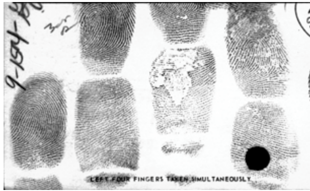
Figure 4 Image where segmentation cuts through the inked fingerprint.