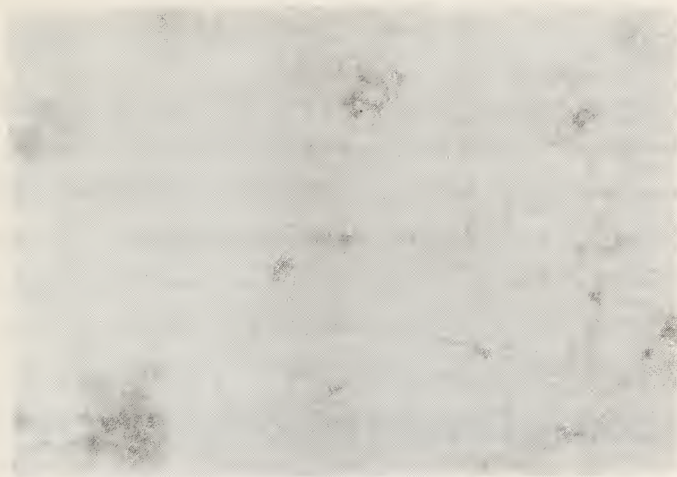
Figure 4. Photomicrograph (10x) of portion of surface area of exposed sample