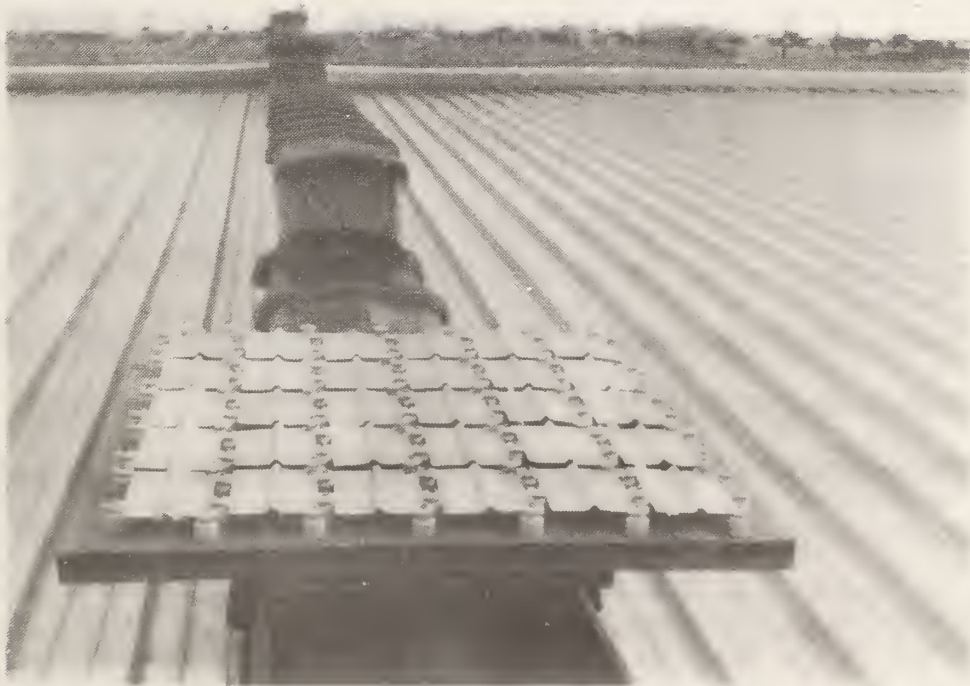
Figure 2. Exposure test rack attached to fire wall between sections of roofing