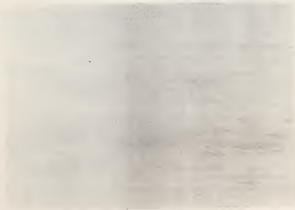
Figure 5. Photomicrograph (10x) of portion of surface area of control sample