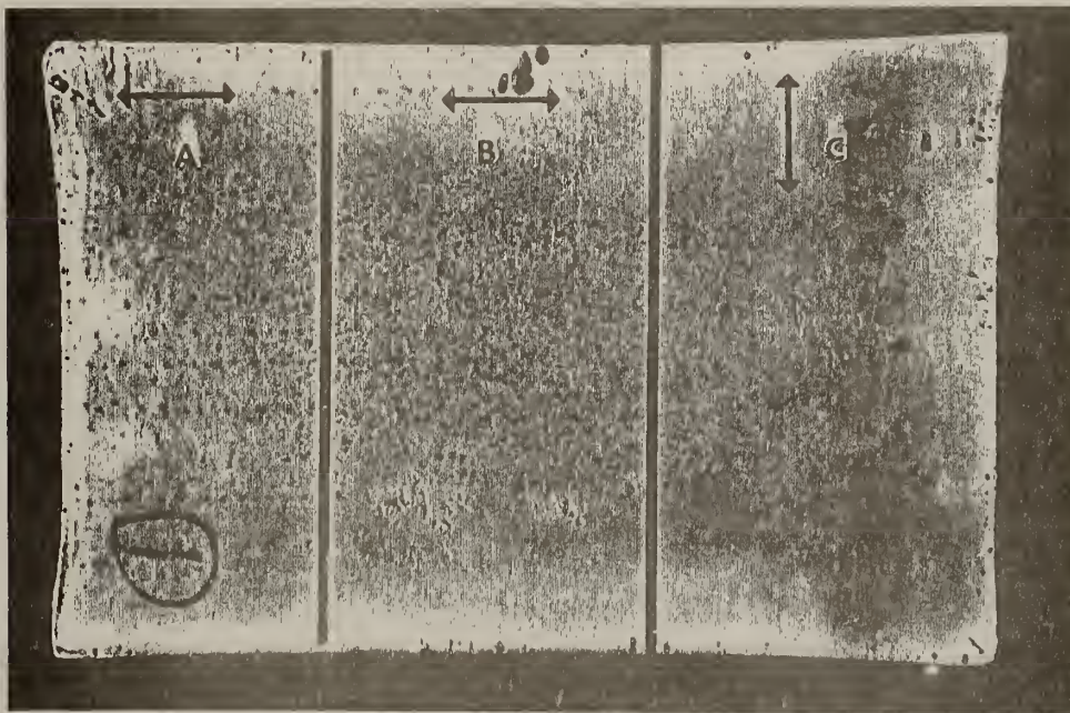
Figure 2. Section of billet of alumina-zirconia-silica showing orientation of test bar specimens.