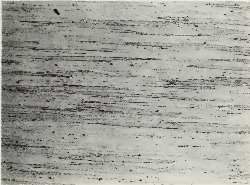
Figure 2. Microstructure of 7049-T73510 aluminum extrusion (long transverse direction). Etched, Keller's etch, X 50.