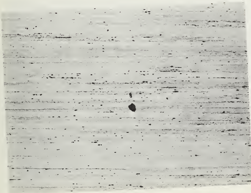
Figure 1. Microstructure of 7049-T76510 aluminum extrusion (long transverse direction). Etched, Keller's etch, X 50.