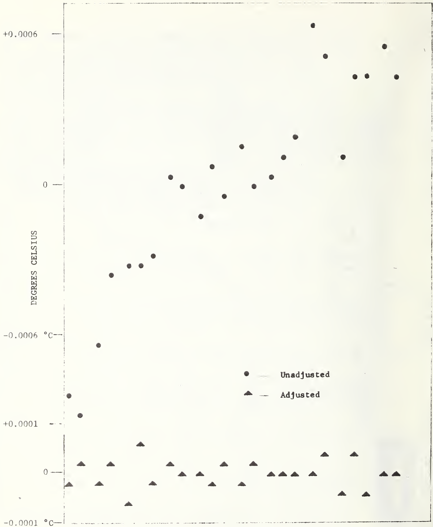
FIGURE 2: Plot of residuals illustrating behavior of bath at 15 °C during 50 minute interval required for the 24 observation series. Data shown before and after adjustment for trend.