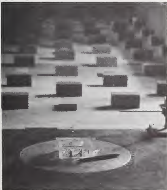
FIGURE 4 PHOTOGRAPH OF SCALE MODEL OF FIELD TEST HOUSE INSTALLED IN UNIVERSITY OF PHILIPPINES WIND TUNNEL.