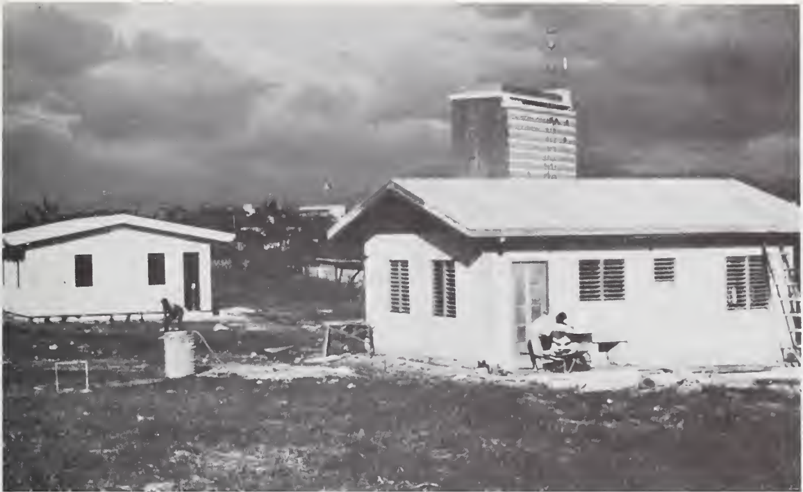
FIGURE 3 TWO TEST HOUSES AT QUEZON CITY SITE.