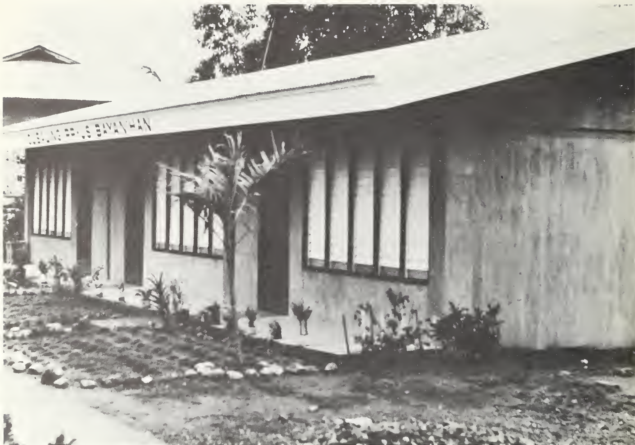
FIGURE 5 BAYANIHAN SCHOOL BUILDING.

nitude of the peak pressures decrease and the sector in which these peak pressures occur becomes smaller. The presence or the absence of roof overhangs does not seem to influence the magnitude of the peak pressures or the sector in which they occur. The same is true for the length-width ratio; this variable does not seem to affect the peak pressures.