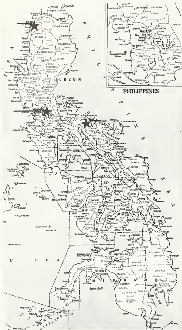
FIGURE 2 FIELD TEST SITES.

Finally, since research findings are valuable only if the technical, economic and cultural environment is right for their acceptance, NBS retained consultants from Bangladesh, Jamaica and the U.S. to develop information on the socio-economic features of the three countries being studied, on the economic aspects of predicting housing need, and on recommended siting, design and construction practices.