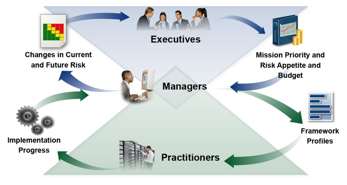
Fig. 5. Using the CSF to improve risk management communication

The CSF provides a basis for improved communication regarding cybersecurity expectations, planning, and resources. The CSF fosters bidirectional information flow (as shown in the top half of Fig. 5) between executives who focus on the organization's priorities and strategic direction and managers who manage specific cybersecurity risks that could affect the achievement of those priorities. The CSF also supports a similar flow (as shown in the bottom half of Fig. 5) between managers and the practitioners who implement and operate the technologies. The left side of the figure indicates the importance of practitioners sharing their updates, insights, and concerns with managers and executives.