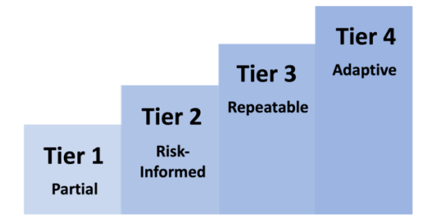
Fig. 4. CSF Tiers for cybersecurity risk governance and management

continuously improving. Selecting Tiers helps set the overall tone for how an organization will manage its cybersecurity risks.