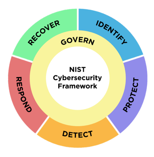
Fig. 2. CSF Functions

The Functions should be addressed concurrently. Actions that support GOVERN, IDENTIFY, PROTECT, and DETECT should all happen continuously, and actions that support RESPOND and RECOVER should be ready at all times and happen when cybersecurity incidents occur. All Functions have vital roles related to cybersecurity incidents. GOVERN, IDENTIFY, and PROTECT outcomes help prevent and prepare for incidents, while GOVERN, DETECT, RESPOND, and RECOVER outcomes help discover and manage incidents.