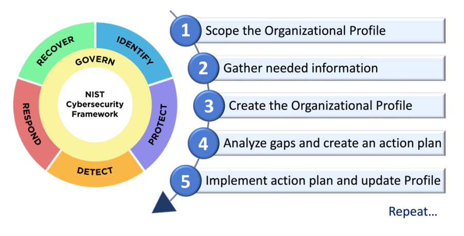
Fig. 3. Steps for creating and using a CSF Organizational Profile

The steps shown in Fig. 3 and summarized below illustrate one way that an organization could use an Organizational Profile to help inform continuous improvement of its cybersecurity.