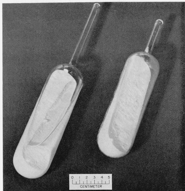
FIGURE 1. Photograph of a sealed ampoule containing sulfur and water (left) and a sealed ampoule containing the purified sulfur (right).

This extraction process removed the excess acid, but the sulfur contained entrapped water in addition to any water that might have been dissolved in it. To remove the water remaining in the ampoule after the last extraction the ampoule was sealed to a vacuum system. A trap immersed in a dry ice bath was sealed between the ampoule and the vacuum pump. The sulfur was slowly melted while the system was being evacuated and the pumping was continued until the pressure in the system was reduced to 10 mm of mercury. The pumping was interrupted and water-pumped nitrogen was admitted to a pressure of 100 mm of mercury, and the system was again evacuated to a pressure of 10 mm of mercury. The sulfur was maintained in the molten state throughout these operations. Water-pumped nitrogen was then admitted until the pressure was 1 atm. The ampoule was sealed off and placed on its side for the