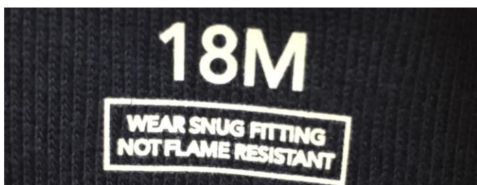
Figure 1 - Tight-fitting sleepwear must also bear a label immediately below the size designation on the front of the sizing label located on the center back of the garment

Tight fitting sleepwear must comply with all of the flammability requirements for clothing textiles (16 CFR 1610) or vinyl plastic film (if applicable).