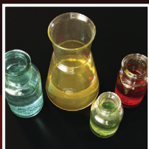
High Purity Materials