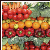
Food & Agriculture