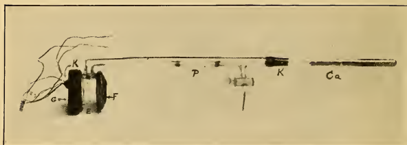
FIG. 2.— Vacuum thermocouple mounting for stellar radiometry