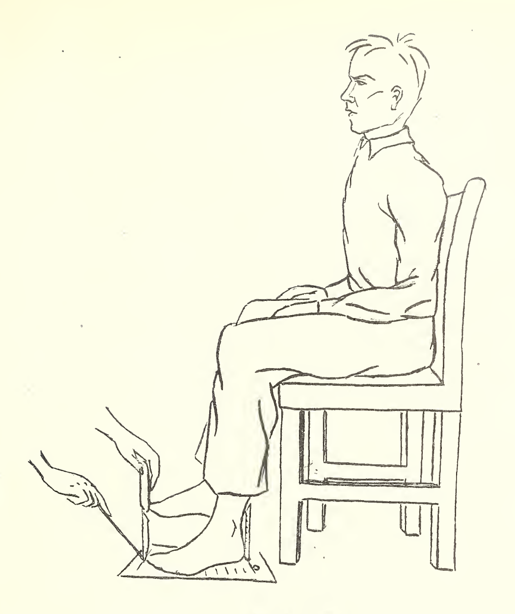
FIG. 2 MEASURING FEET WITH SIZE CHART